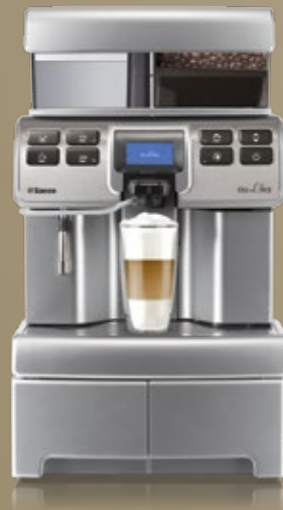
Aulika Top / Top RI High Speed Cappuccino