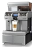
Aulika Top / Top RI High Speed Cappuccino