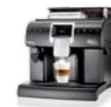
Royal Gran Crema

*Supplied separately; installed by the operator