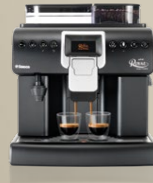
Royal Gran Crema

Cup warmer Pre-ground coffee option Steel conical blades