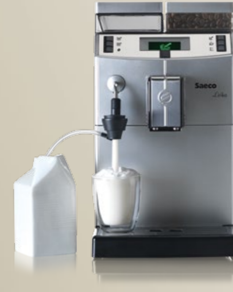
Lirika Tuono Cappuccinatore

Tuono cappuccinatore to be mounted on the steam wand for the frothing of creamy cappuccinos and milk drinks. It can be used also in combination with the Milk Cooler.